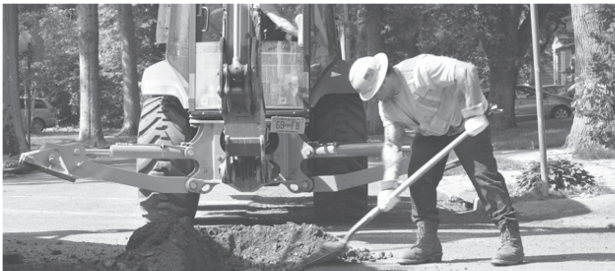
Gas Modernization Program – May 26, 2016, Montclair, NJ

Our strong balance sheet is one key to our financial strength. We continue to maintain a solid financial profile capable of meeting our growth objectives, without diluting our current shareholders through the issuance of new equity.