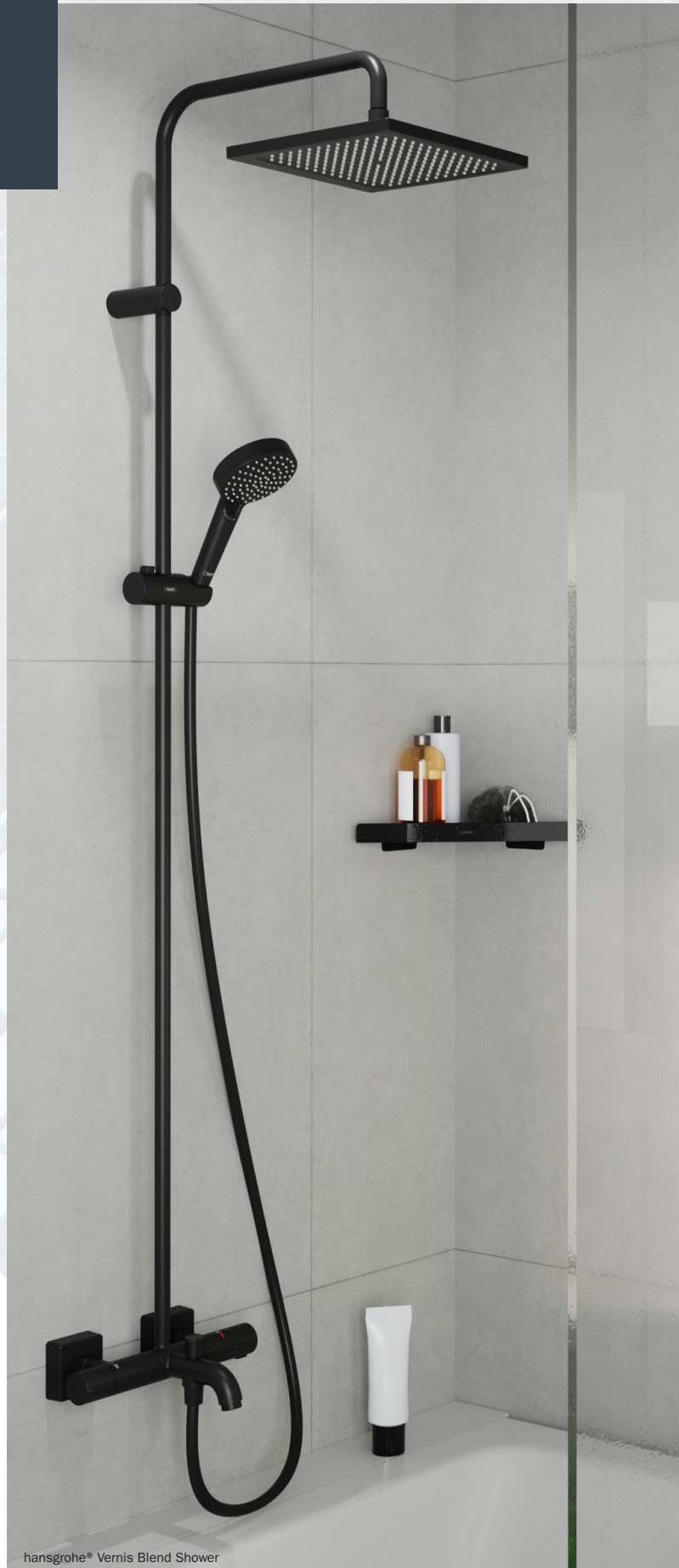
hansgrohe® Vernis Blend Shower