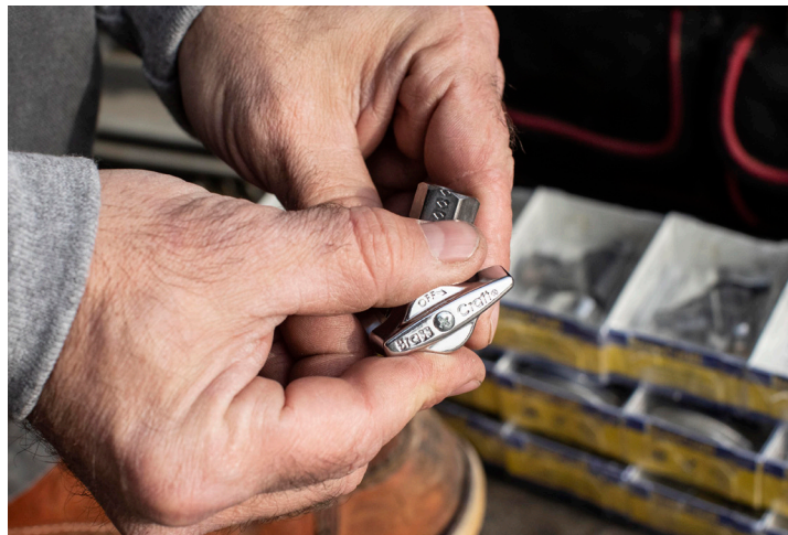
On this page: Kraus® Kore™ Kitchen Sink, Newport Brass Tolmin Widespread Lavatory Faucet, BrassCraft® G2 1/4-Turn Water Stop