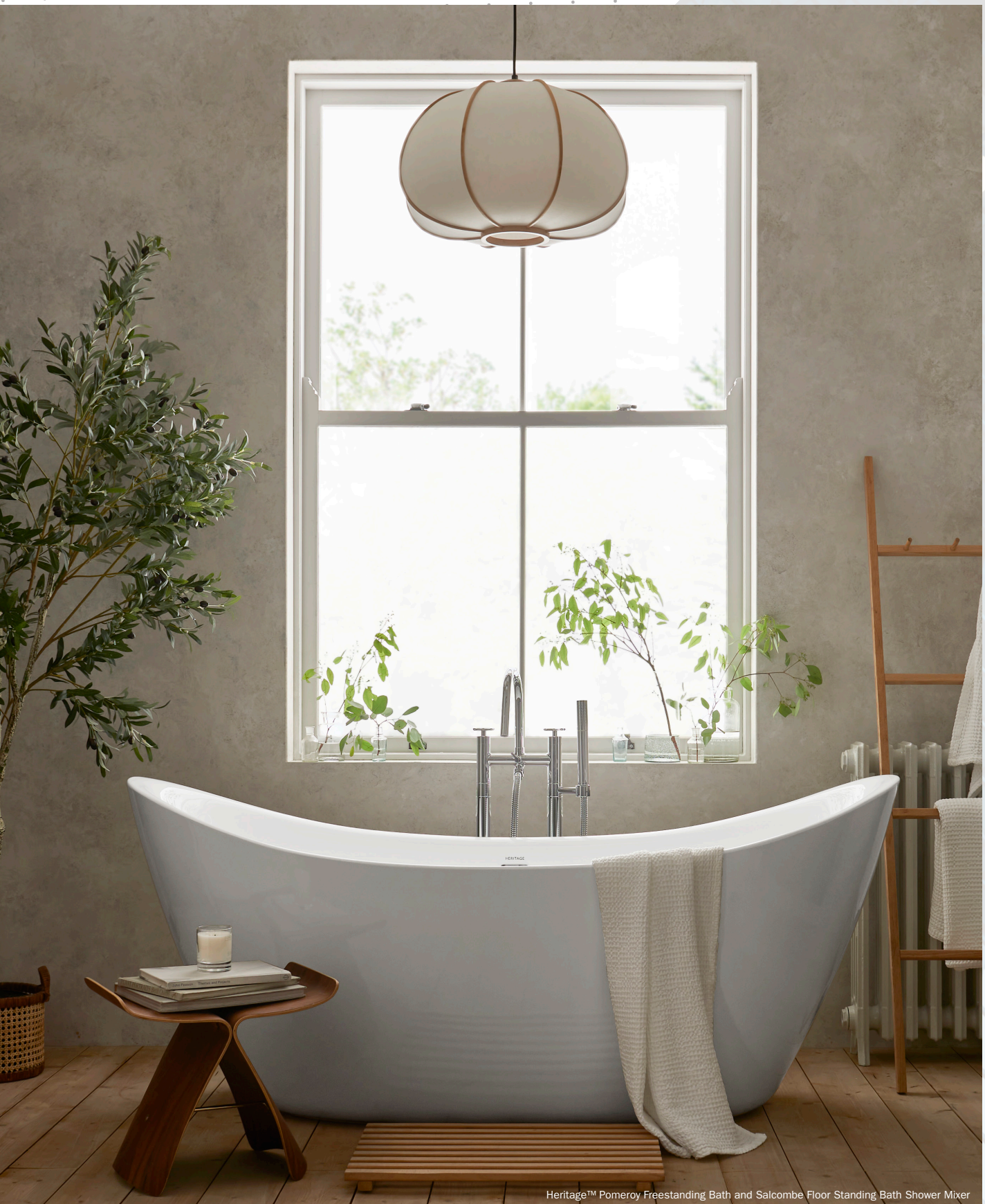
Heritage™ Pomeroy Freestanding Bath and Salcombe Floor Standing Bath Shower Mixer