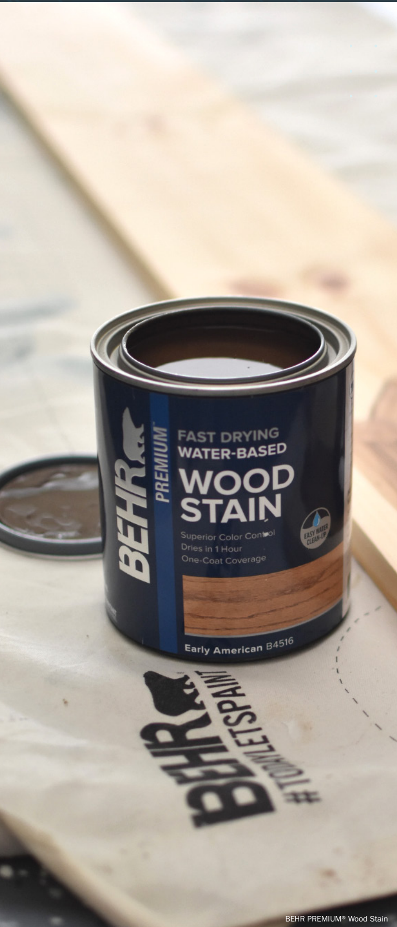
BEHR PREMIUM® Wood Stain