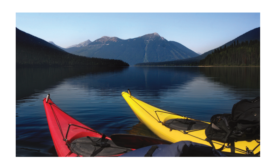
MasterCard Annual Report 2014